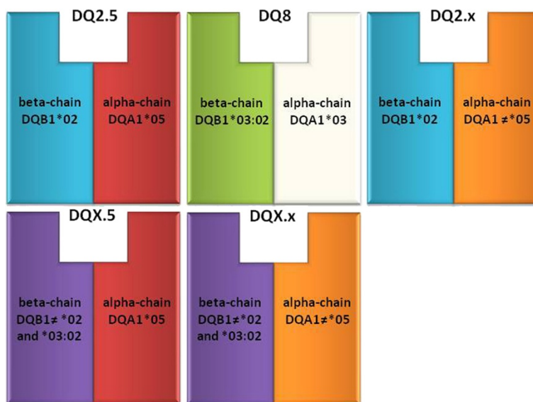
Figure 1 CD at-risk DQ heterodimers encoded by different combinations of DQA1 and DQB1 alleles.

celiacs are frequently male [14]. Figure 1 summarizes the different DQ glycoproteins with regard to the CD-predisposing alleles.