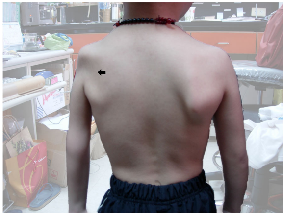
Fig. 3 A boy who had left shoulder subluxation and left arm atrophy (arrow) due to polio-like syndrome

onset would have lower full-scale IQs, and are more likely to have a full-scale IQ < 85 than those whose age at onset was 2 years or older [31].