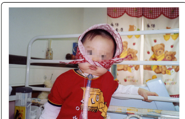
Fig. 1 A child who had tracheostomy with ventilator support because he had central hypoventilation

For patients with polio-like syndrome, about 50% have limb weakness and atrophy. In our follow-up study, about one half (56%) of patients with a poliomyelitis-like syndrome had unilateral limb weakness and atrophy [31]. Among them, most patients needed limb rehabilitation. Further, a few of them even needed reconstructive surgical interventions. Figure 3 shows a boy who had left shoulder subluxation and left arm atrophy due to the polio-like syndrome.